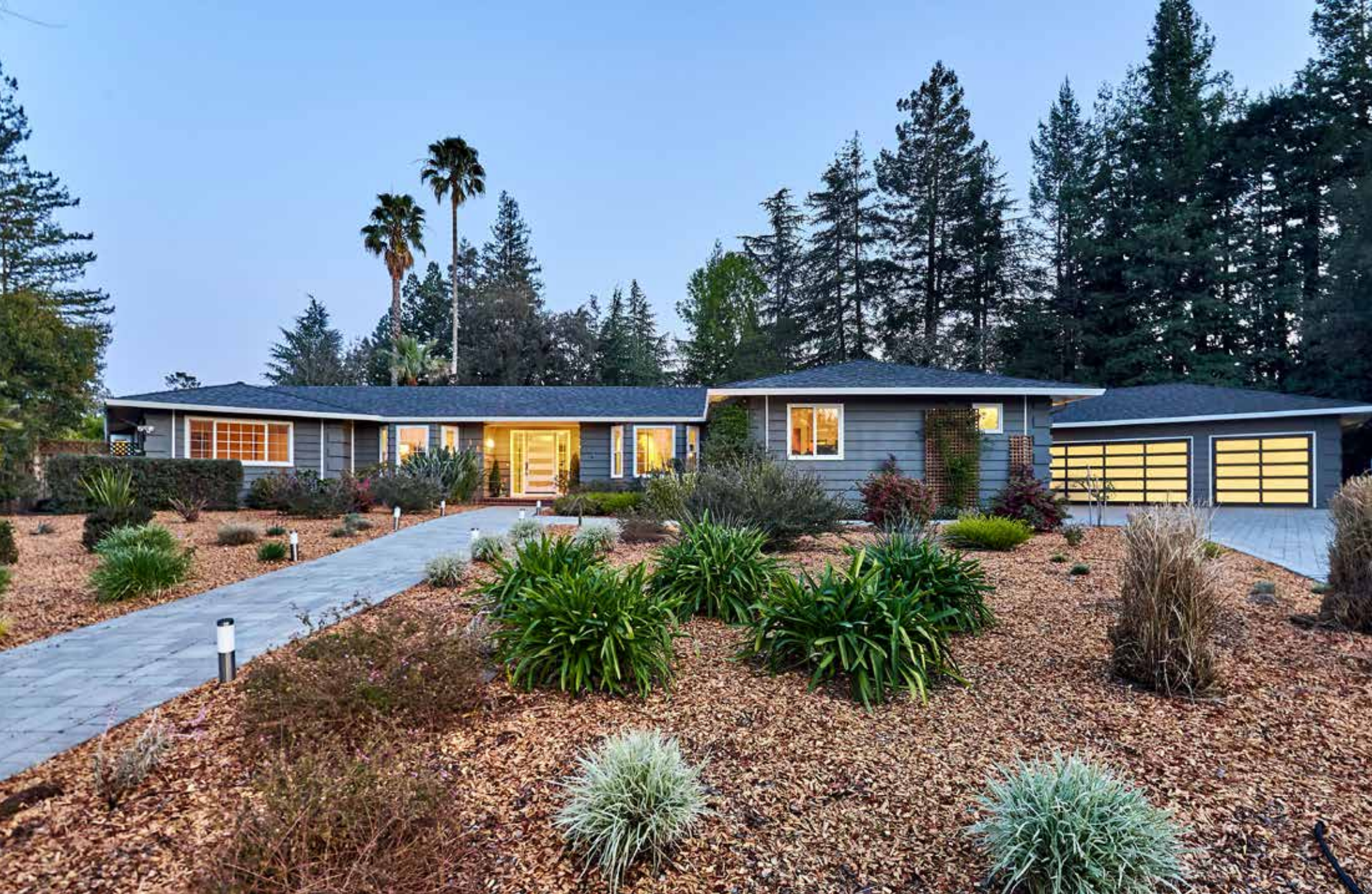
Light-Bathed Remodeled Ranch with Contemporary Appeal 19682 MONTAUK COURT, SARATOGA