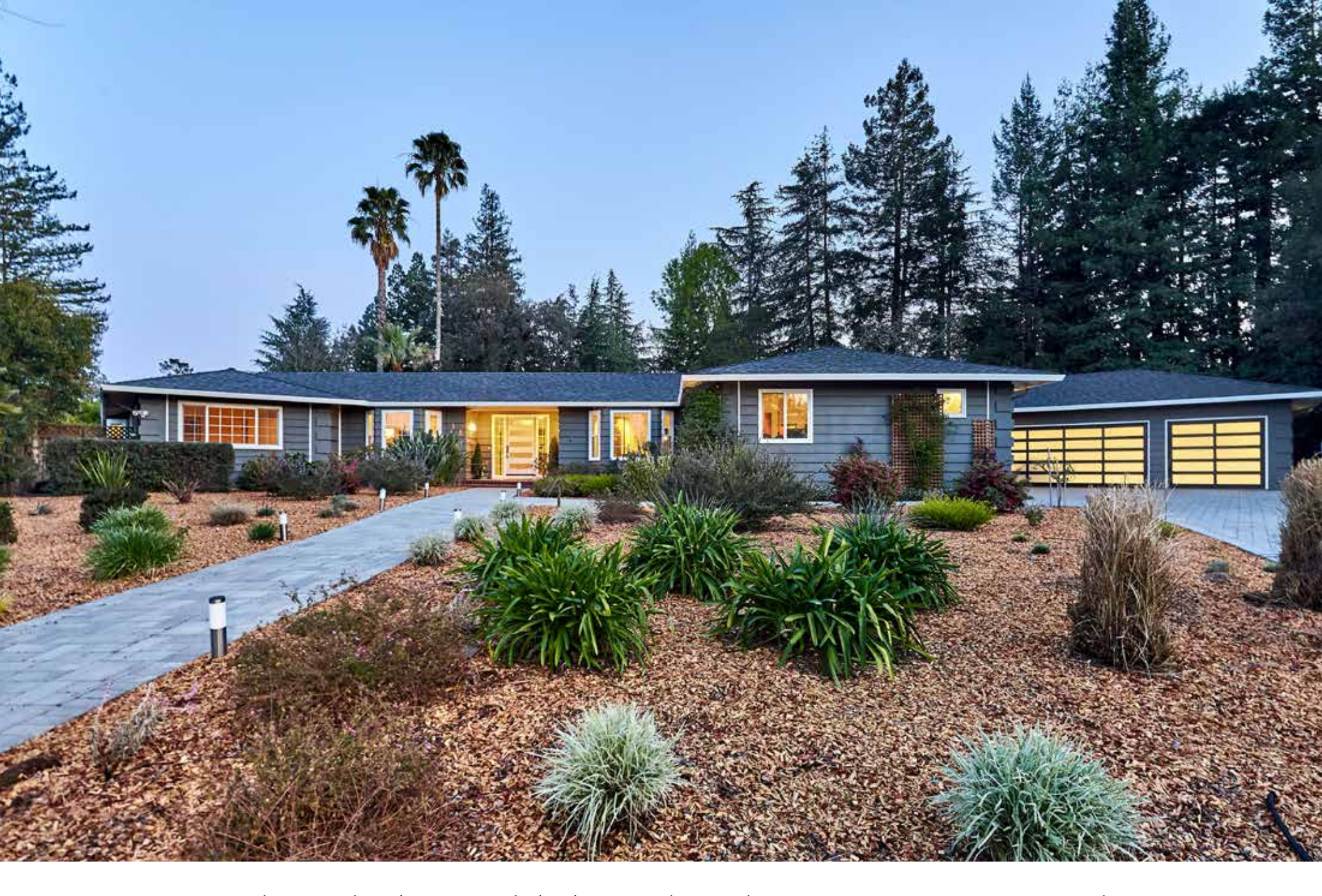
Light-Bathed Remodeled Ranch with Contemporary Appeal 19682 MONTAUK COURT, SARATOGA